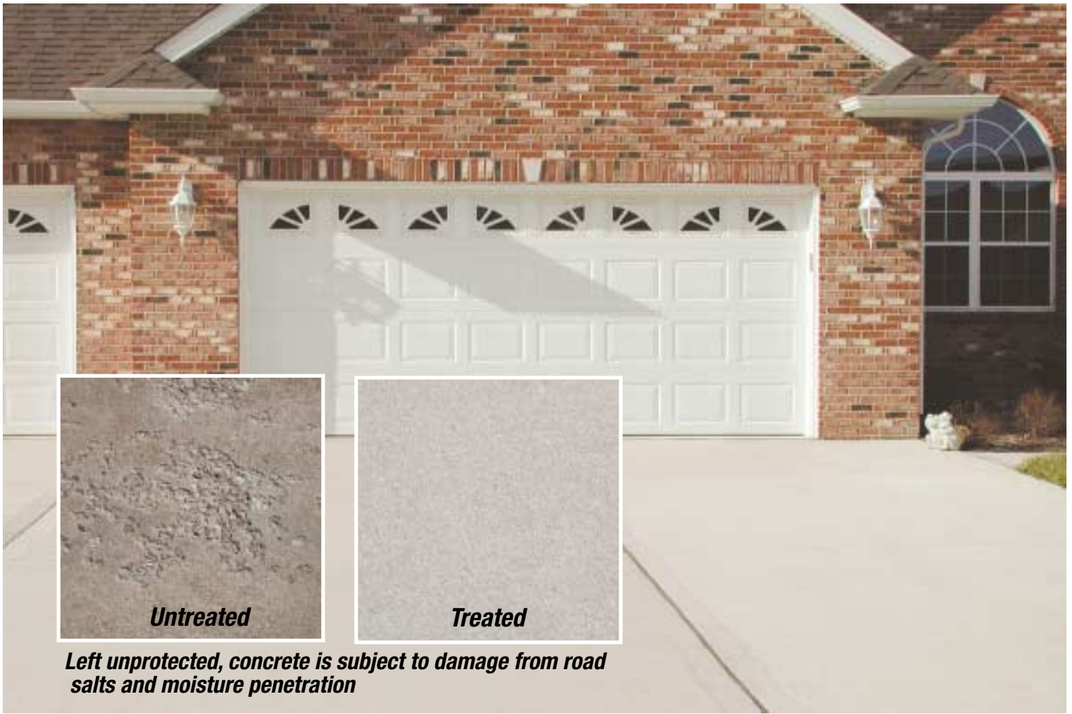
Left unprotected, concrete is subject to damage from road salts and moisture penetration